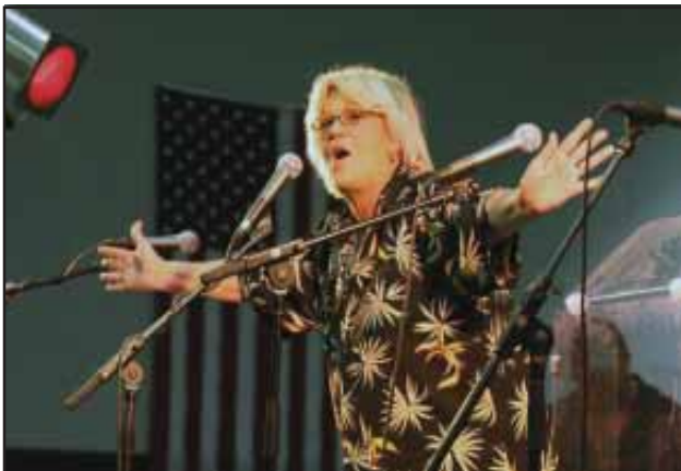
Legendary rock & blues singer Bonnie Bramlett brings down the house

Rock 'N Roll RuleS Rock 'N Roll Rules Rock 'N Roll RuleS